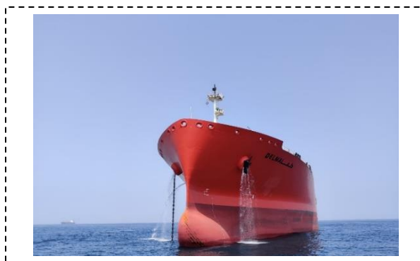
ADNOC L&S' Very Large Gas Carrier, serving AW Shipping Joint Venture with Wanhua Chemical.

ADNOC Logistics and Services (ADNOC L&S) is the largest fully integrated shipping and maritime logistics company in the UAE and GCC region. Energy efficiency is a strategic priority for the company, and we focus on digital transformation and innovation to decarbonize our operations. Over the past three years and through a dedicated energy efficiency program, ADNOC L&S successfully achieved 39% reduction in energy consumption following the implementation of energy management strategies through ISO 50001.