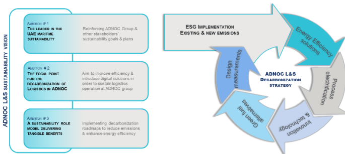
Figure 2. ADNOC L&S Sustainability Vision

Other initiatives being implemented in parallel relate to shore power at ADNOC L&S' integrated logistics bases in Mussafah and Ruwais. Alternative fuels (e.g., biofuel, methanol, ammonia, H 2 ), battery hybridization, & CCS are under review for future development. The goal is to reduce energy consumption and CO 2 emissions by 25% by 2030 in line with ADNOC vision.