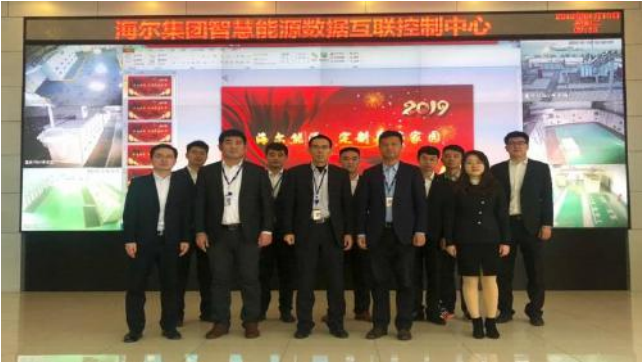
Open intelligent energy management platform based on energy management system construction