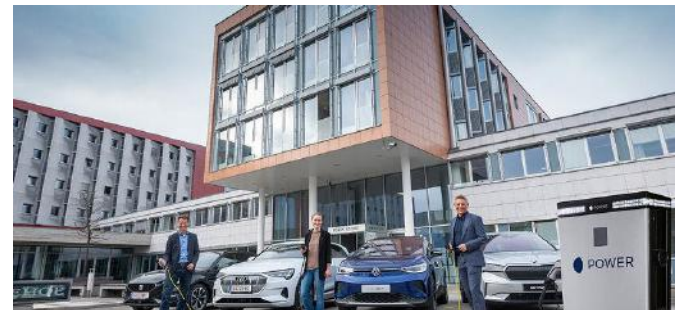
Figure 4: Press release E-Mobility Porschehof

Energy management and energy targets are communicated again and again during press releases and via channels such as LinkedIn. The PHS has also repeatedly submitted projects to “klimaaktiv”, which are then communicated externally. However, the certification was not reported via a reporting program.