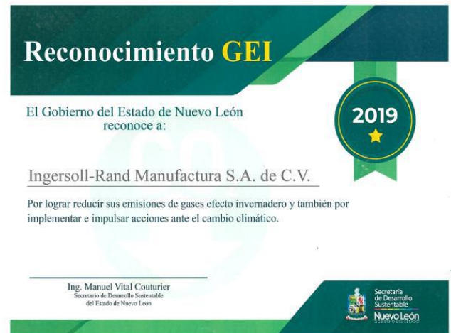
Figure 6. Green House Gas Reduction Recognition by the State of Nuevo León

Development of our state (Figure 6). This recognition confirms our efforts in reducing energy consumption and greenhouse gas emissions implementing and leading by example with actions against climate change.