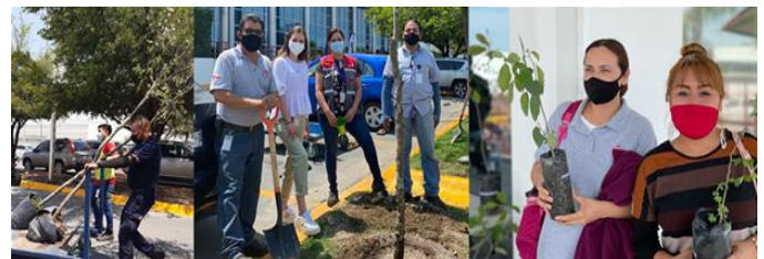
Figure 2. Reforestation Activity 2020 Trane Monterrey

We're challenging others in our industry and communities to join us with several social responsibility programs that embody sustainability. These past years we've made several reforestation campaigns not only on our site but on our city. In 2020 in one of these instances a total of 50 trees were planted on site and 200 others were given to different participants to plant all over the city. Each year the reforestation participation is increasing confirming our commitment to a more sustainable tomorrow (Figure 2).