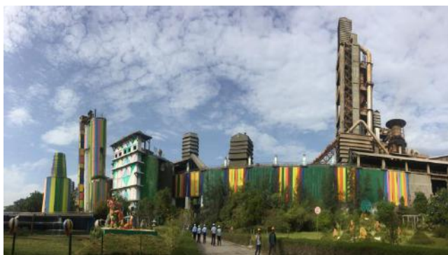
DALMIA CEMENT (BHARAT) LTD – DALMIAPURAM PLANT

Successfully achieved 6.5% reduction in the SEC, as against given target of 4.5% during "PAT"- Cycle-1 (SEC= Specific Energy Consumption)