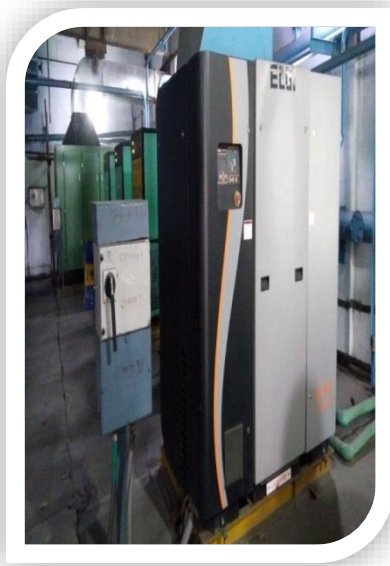
VFD's for Compressors