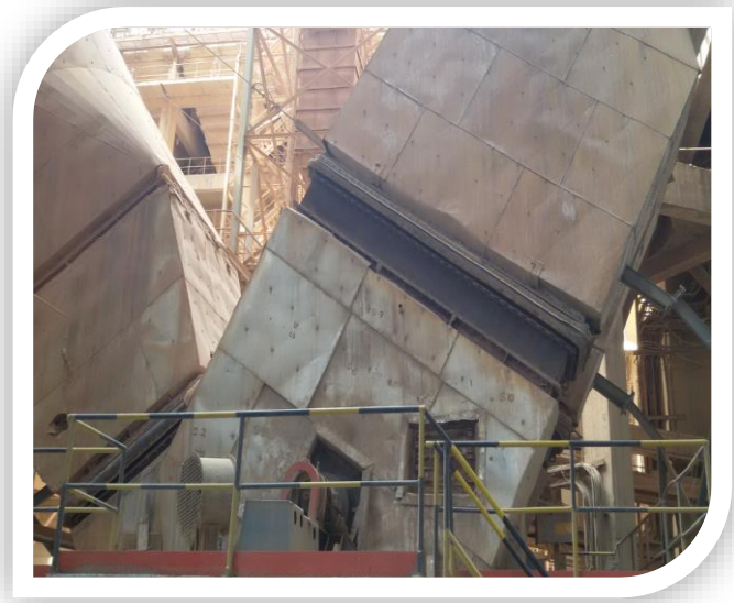
Preheater Fan Damper removal in Line-2