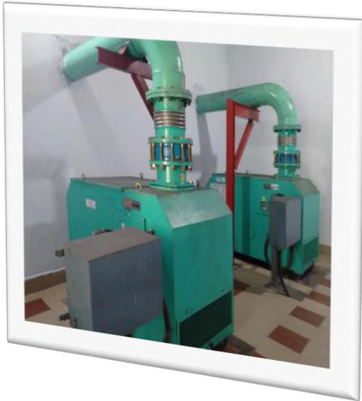
PD Blower to Turbo Blower