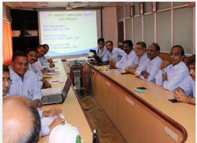
Energy Management Team