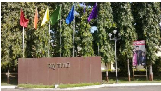
Raymond Limited, Textile Division, Jalgaon

Raymond Ltd Jalgaon division is one of the 4 Textile units established in year 1979 with manufacturing capacity of 79 lakh meters per annum of worsted suiting. Worst division manufacturing Worsted Suiting fabric with polyester-wool and polyester-viscose blends.